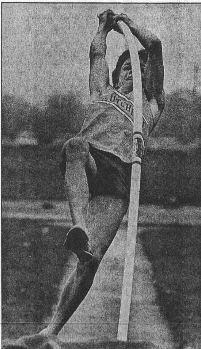
1983 file photo

"I went through a drug period when I was in Indiana. For me to say I want to go to Hollywood, people would think it would only