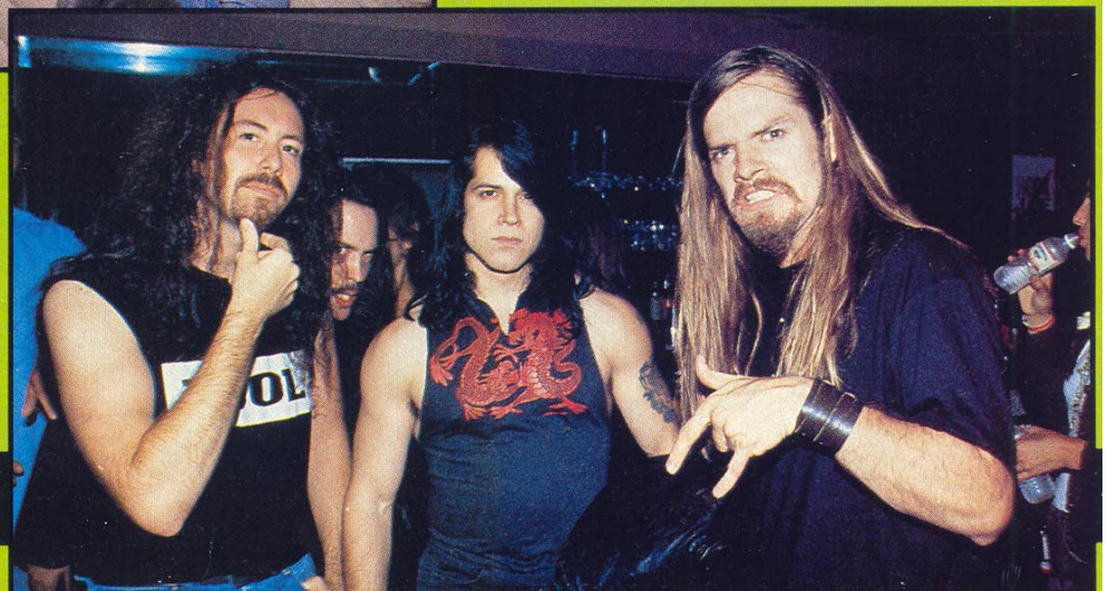
Corrosion Of Conformity (with Glenn Danzig): Heavy duty!