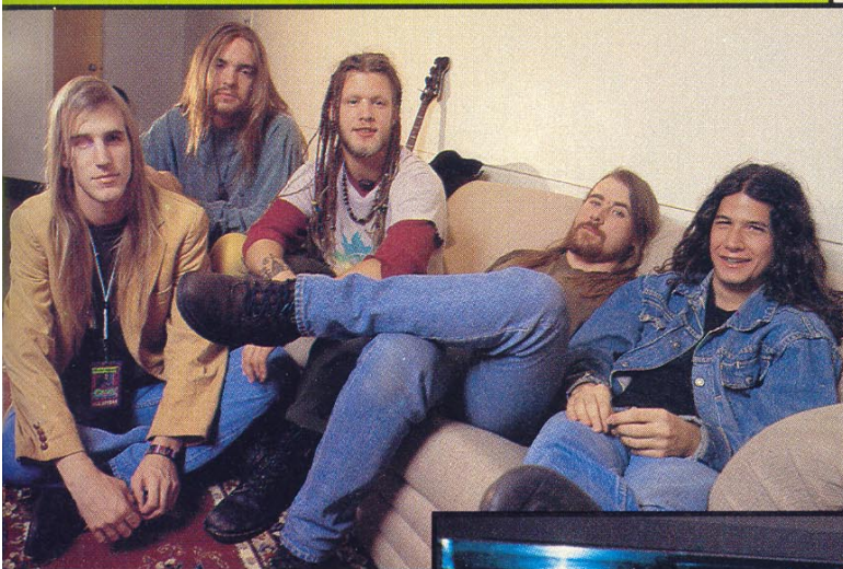
Blind Melon: The breakthrough band for '93?