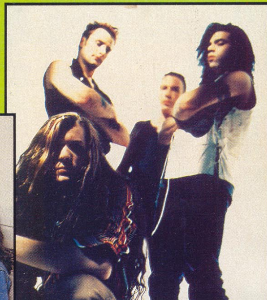
Warrior Soul: Big egos, big talent!