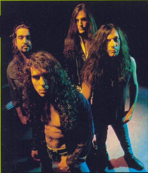
Non-Fiction: Hard rock played with passion and purpose.