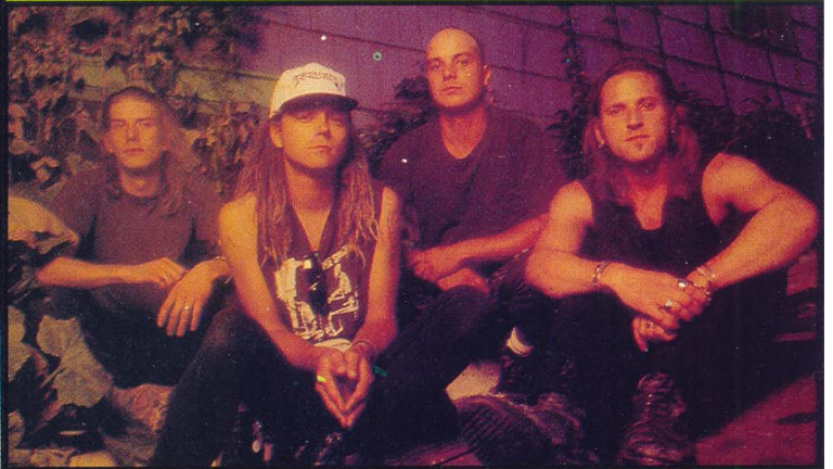
Gruntruck: A pedal to the metal unit.