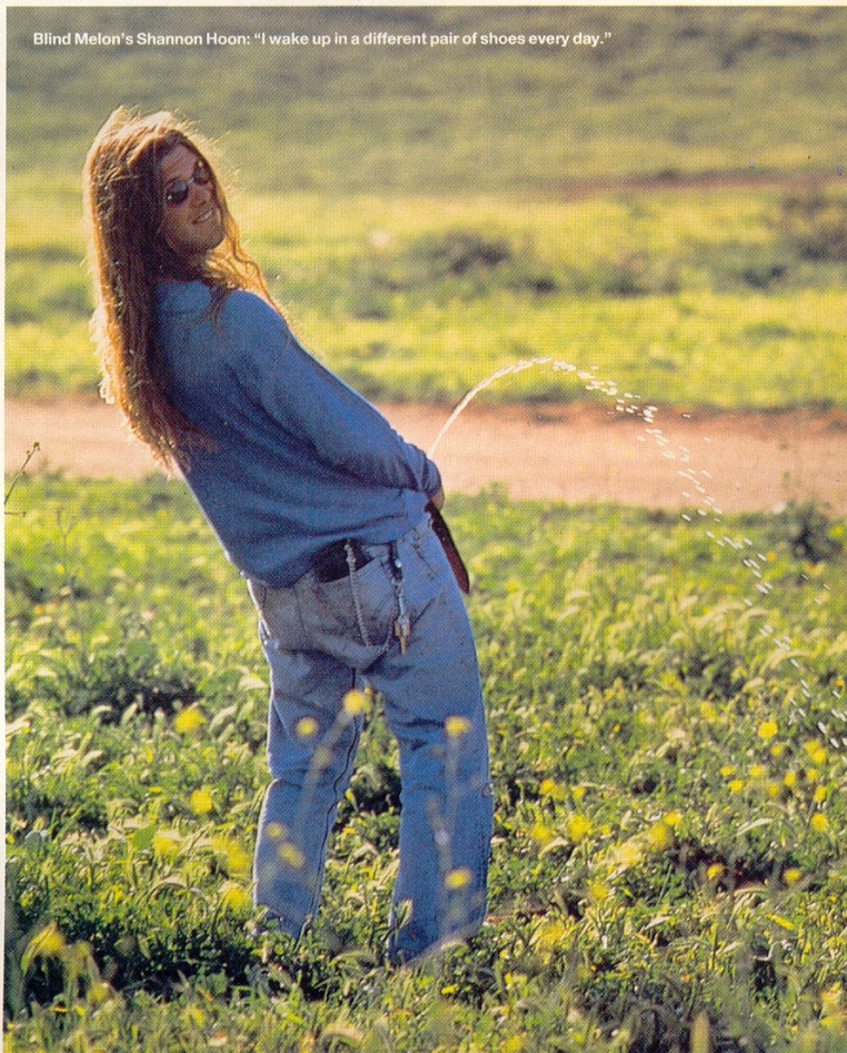
Blind Melon's Shannon Hoon: "I wake up in a different pair of shoes every day."