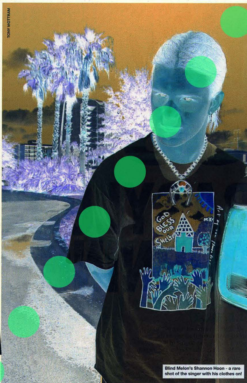
Blind Melon's Shannon Hoon - a rare shot of the singer with his clothes on!