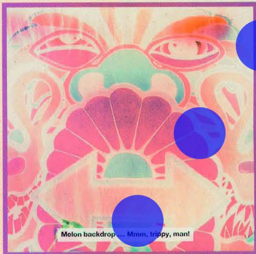
Melon backdrop... Mmm, trippy, man!

2X4 TONES SEED DAD (NO INTRO) WONDER (NO INTRO) TIME WILT NO RAIN SOUP DESERTED ST ANDREWS PAPER CANDY CHANGE SOAK