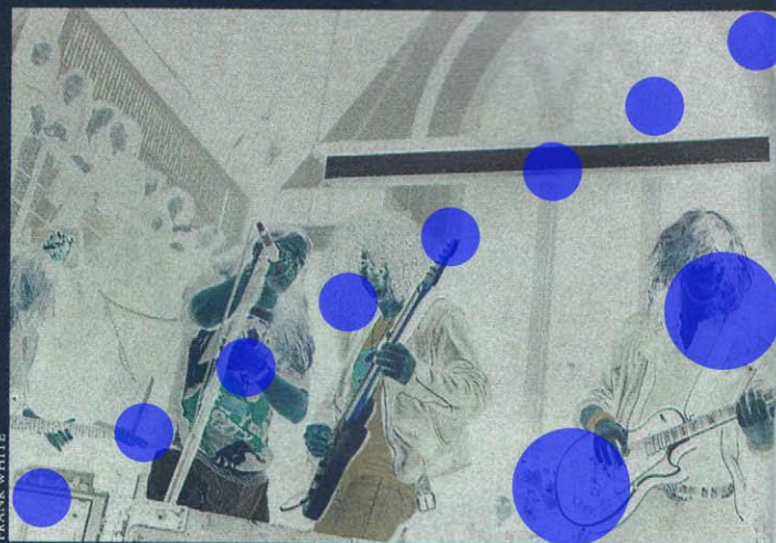
From left: Hoon, Slash and Duff