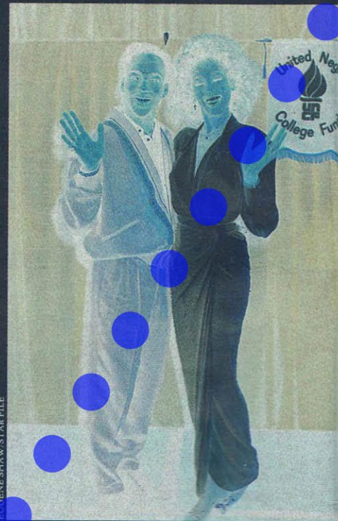
Below: Brown and Houston, giddy with love

hinted at a career decision to wed BOBBY BROWN. Backstage at the Billboard Music Awards, Houston, whose "Star-Spangled Banner" at last year's Super Bowl introduced the country to the art of patriotic pantomime, caused a stir by flashing a large rock on her finger but failed to mouth a date for the potential pop nuptials.