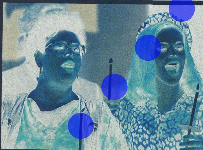
Above: Phoebe Snow (left) and Lady Miss Kier at the Reebok Awards