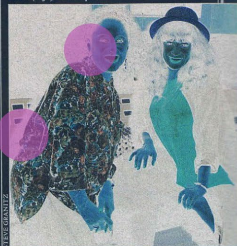
Love (left) with Spector

M aking A Christmas Gift for You with PHIL SPECTOR, I wondered if we'd get away with rockin'," says DARLENE LOVE. "I guess we did." Now, nearly thirty years later, Love and RONNIE SPECTOR have contributed their first-ever duet to the Special Olympics' Very Special Christmas II . "It's great to see Darlene," says Ronnie. "When I was with Phil, I never saw anybody."