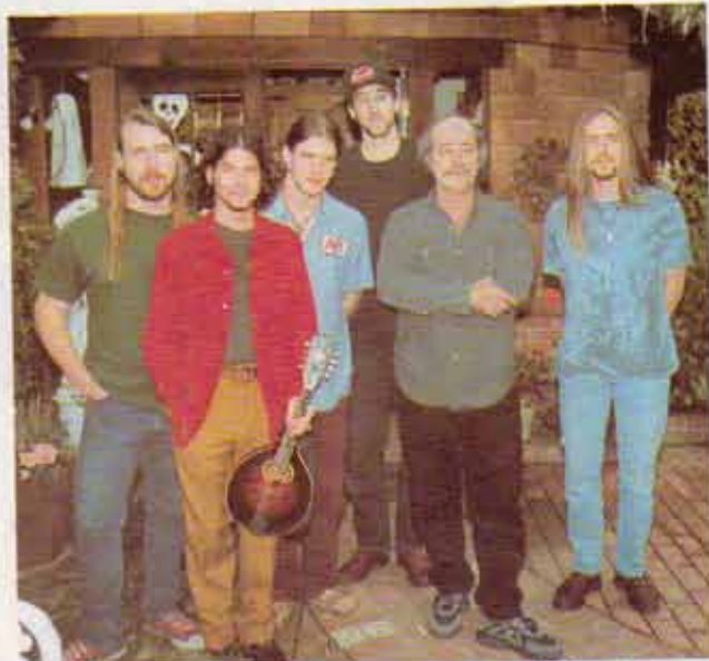
One for the time capsule: Robert Hunter, Blind Melon, and the mandolin "that wanted to be a Melon."

ROGERS: When we play live, we're at least 50 times as heavy as our record. I mean, we can play all of our parts, but we're definitely energetic