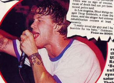
SHANNON HOON's last UK appearance: London Mean Fiddler, September 8, 1995